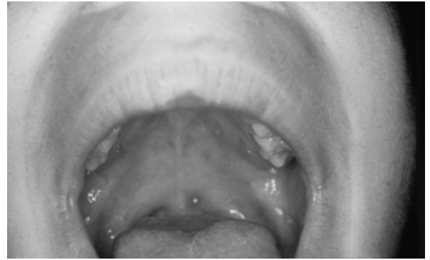
This patient developed palatal mucosal lesions due to chickenpox.

Shingles primarily affects older adults and the immunocompromised but can occur in any age group. When present, the oral and maxillofacial manifestations of shingles can be severe and cause intense, prolonged pain. Oral manifestations of shingles commonly involve the ophthalmic, maxillary, and mandibular division of the trigeminal nerve. Unilateral distribution is a classic feature, as the cutaneous and intraoral lesions of shingles do not cross midline [30; 31]. Vesicles form and rupture to form painful ulcers in the affected areas, which can take two weeks or longer to heal. The pain that accompanies the intraoral lesions can make eating and swallowing extremely difficult. Topical anesthetic solutions may offer some relief from this