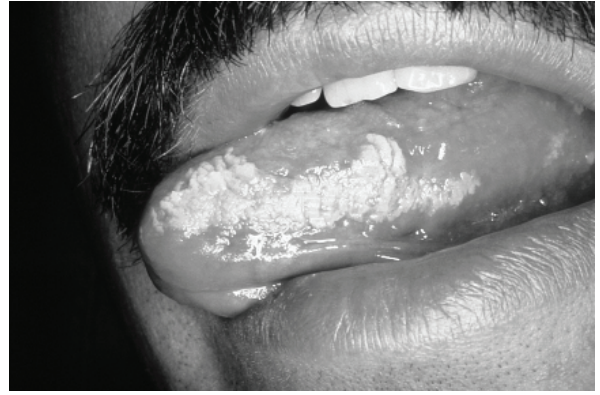
This patient with HIV presented with signs of advanced oral hairy leukoplakia on the lateral border of his tongue.