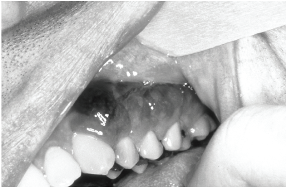
Kaposi sarcoma in the mouth of a patient with AIDS.