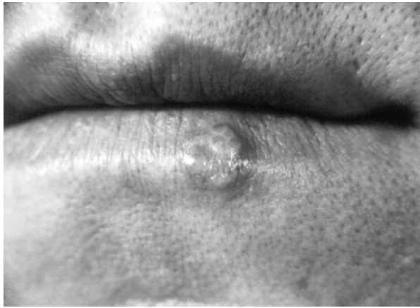
This is a close-up of the lip of patient with a herpes simplex lesion on the lower lip due to the herpes simplex virus type 1 pathogen.