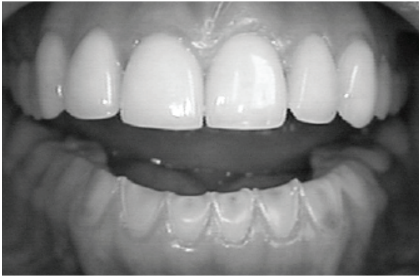
Erosion on the mandibular teeth caused by bulimia, compared with the restored maxillary teeth.