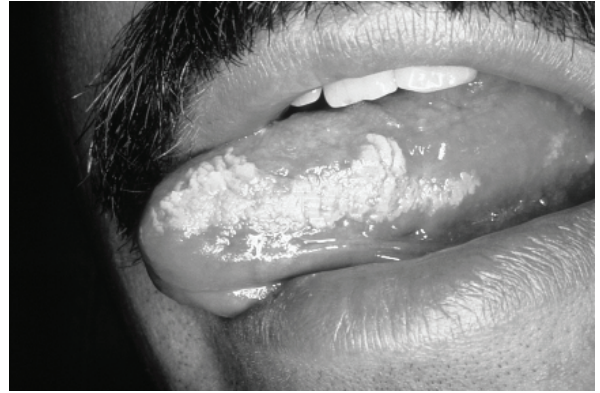
This patient with HIV presented with signs of advanced oral hairy leukoplakia on the lateral border of his tongue.